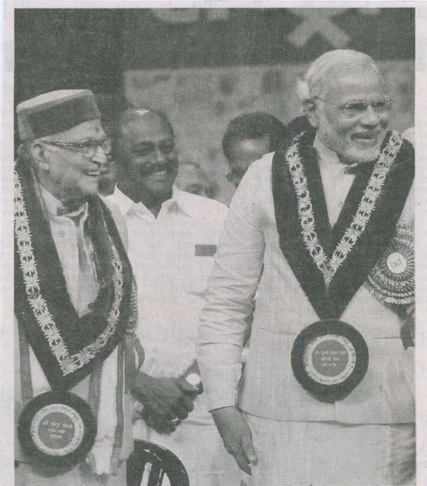
BJP leaders Manohar Joshi and Narendra Modi during the Traders' National Summit in New Delhi on Thursday.