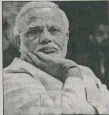
Narendra Modi at a talk on 'Economic Growth-The Way Forward' organised by Bhartiya Vitta Salahkar Samiti in New Delhi on Thursday.

Batting for a massive 'kayalp (complete overhaul)' of governance, Modi pitched hard for a strong federal structure and said the fashion of running the affairs of the country from Delhi should stop. States must be trusted to govern, he