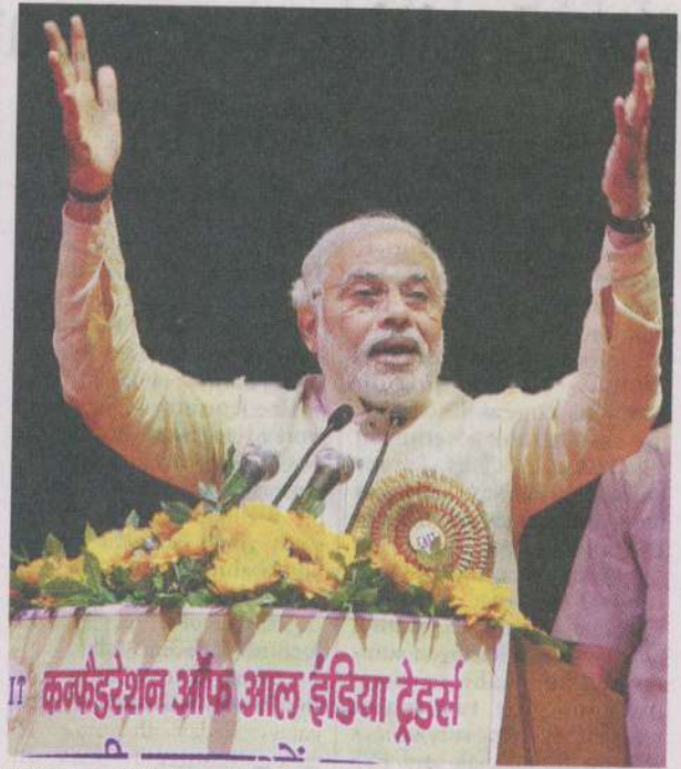
BJP's prime ministerial candidate Narendra Modi addresses traders during the Traders' National Summit in New Delhi on Thursday

Asking traders not to be scared of global competition or e-commerce, he sought them to innovate and invent newer ways to outwit competition from malls. He said they should adept themselves to new infor-