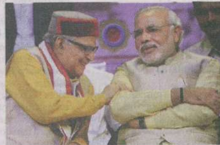
BJP's prime ministerial candidate Narendra Modi and senior BJP leader Murli Manohar Joshi at the Traders' National Summit in New Delhi on Thursday

Describing Modi as "future PM of the country", Joshi said like small farmers and