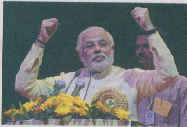
BJP PM candidate Narendra Modi addresses members at the Confederation of All-India Traders national summit in New Delhi on Thursday.

Mr Modi, who attended three separate events in New Delhi on Thursday, said the country could progress only if it was run "together" by the Prime